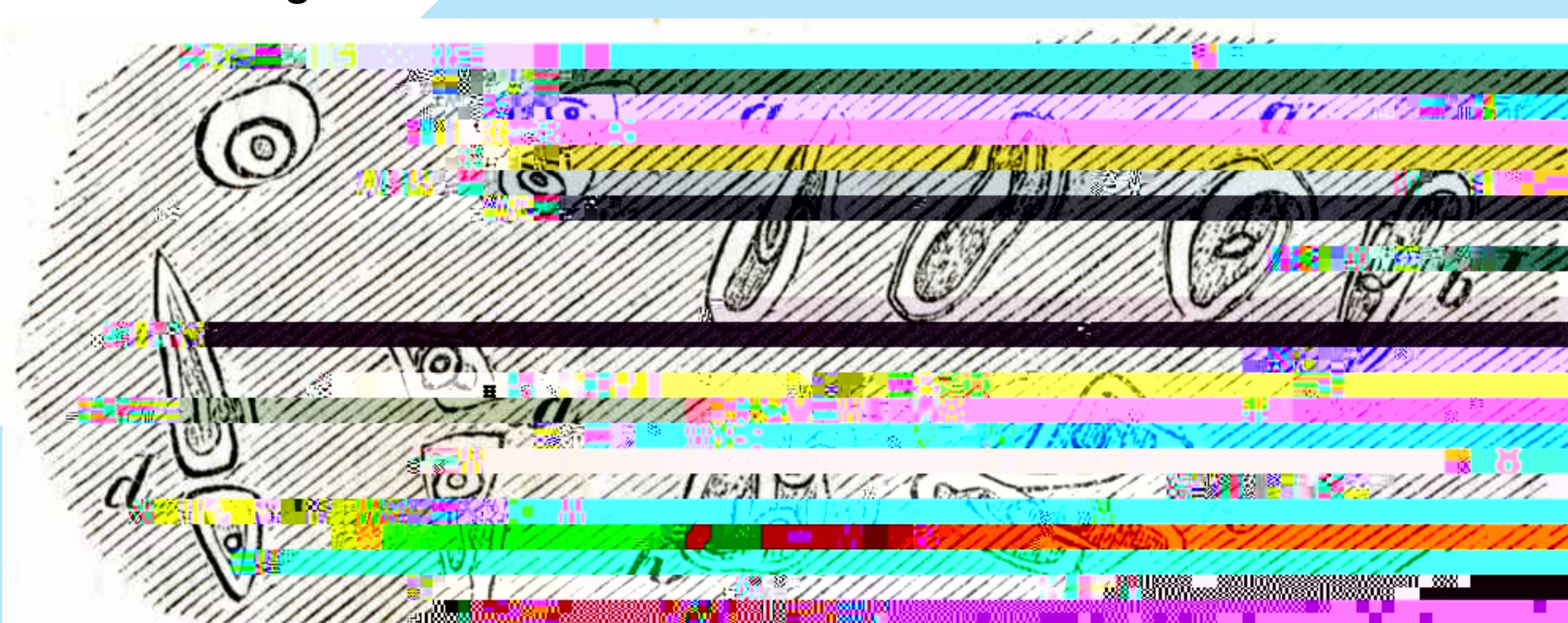
Cells dividing Virchow 1858

The cell theory established that cells are the fundamental units of living organisms, which arise through cell division, and that cells each have a nucleus and also material called protoplasm. But what is protoplasm and what is its role in life?