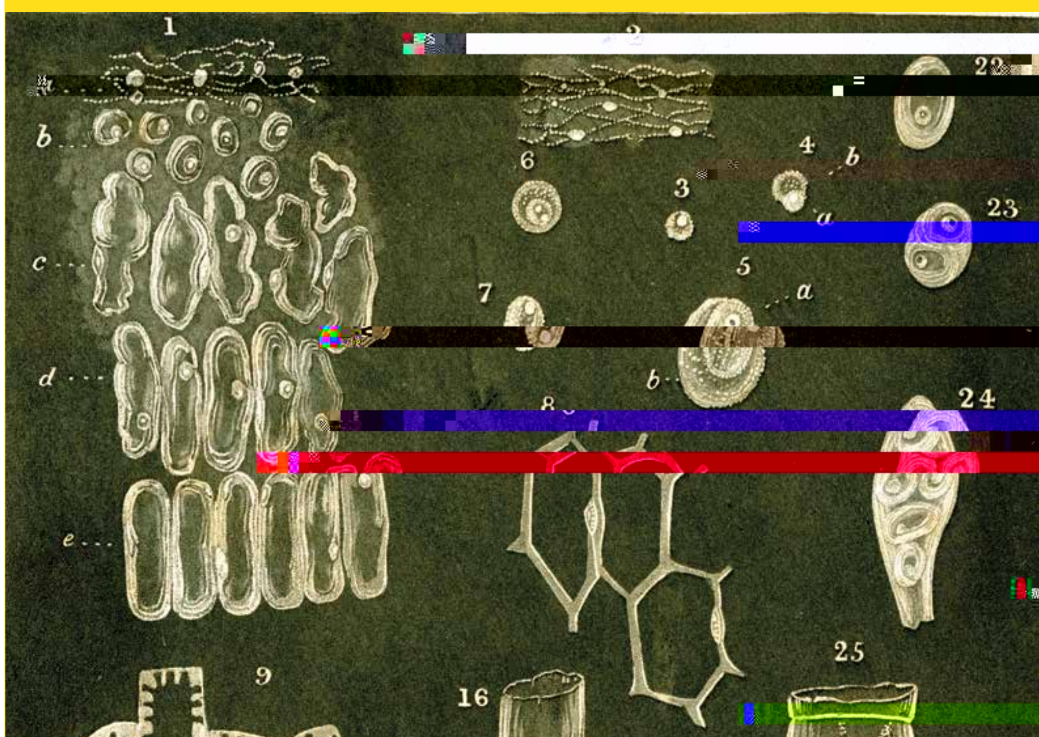
Plant cells Schleiden 1838